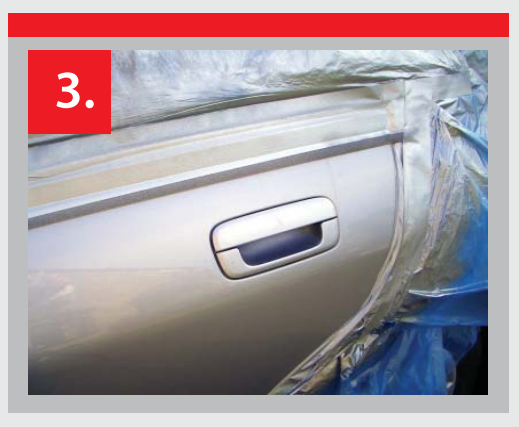
3. After masking, spray the panel as normal.