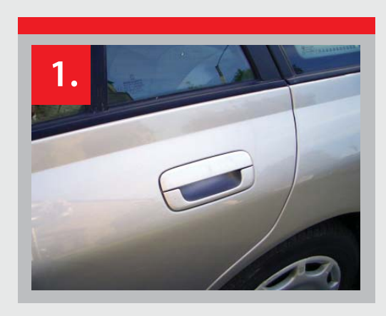
1. Choose the swage line to blend up to.