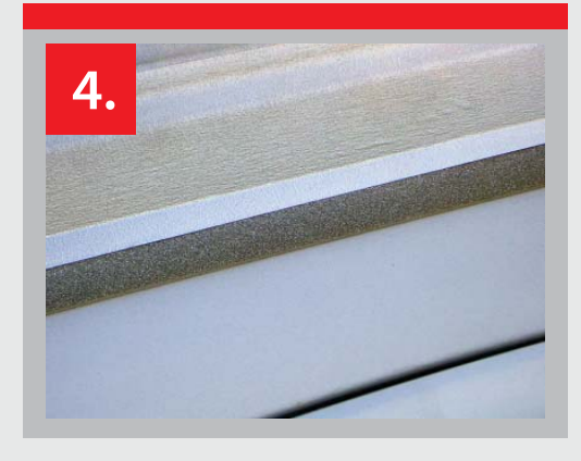
4. Ensure that the paintwork is dry before de-masking.