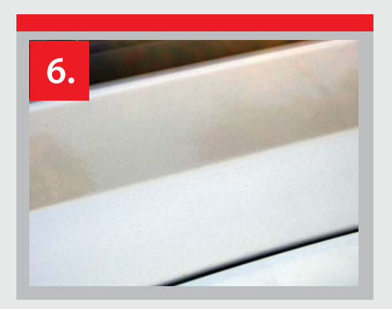
6. This will now result in a seamless transition between old and new paintwork along the swage line edge - avoiding any unnecessary rework.